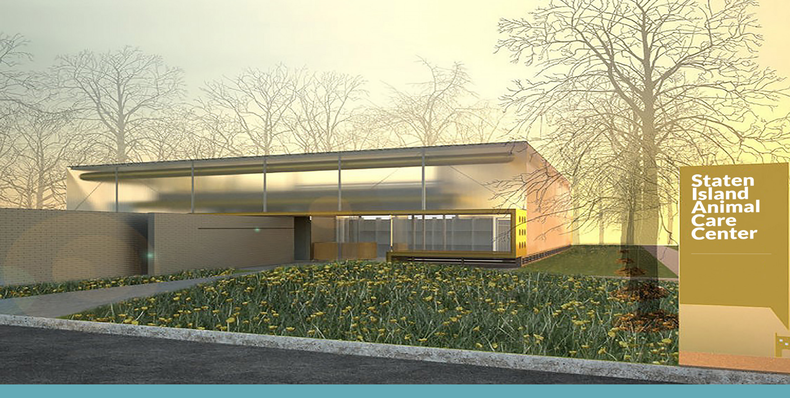
Staten Island Animal Care Center