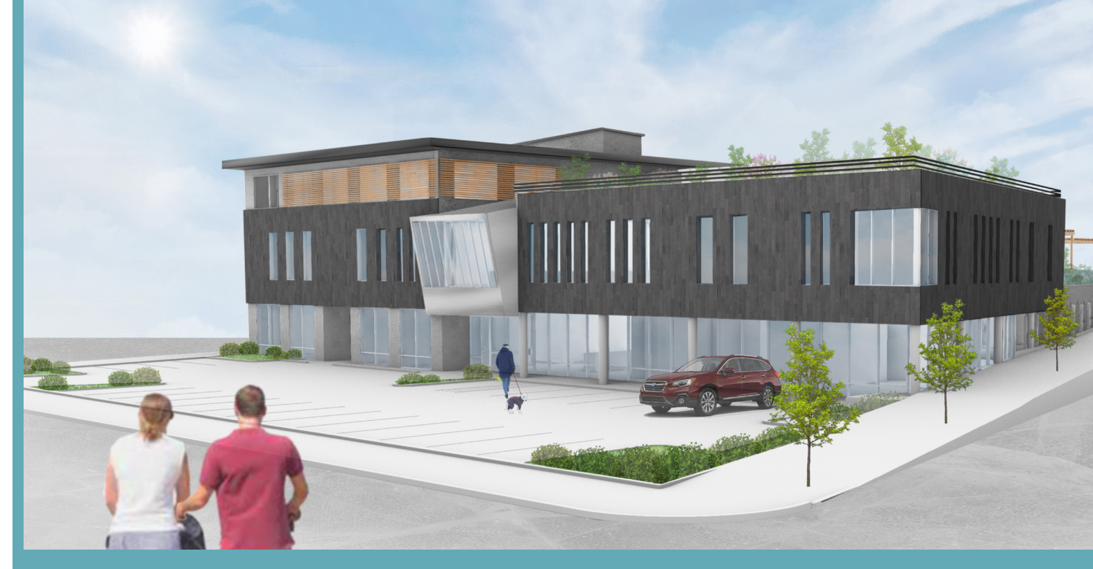
Queens Animal Care Center